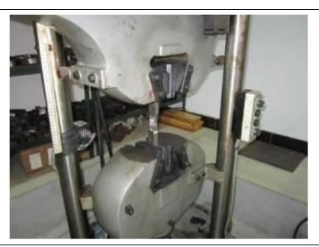
Material tensile test for welding bead