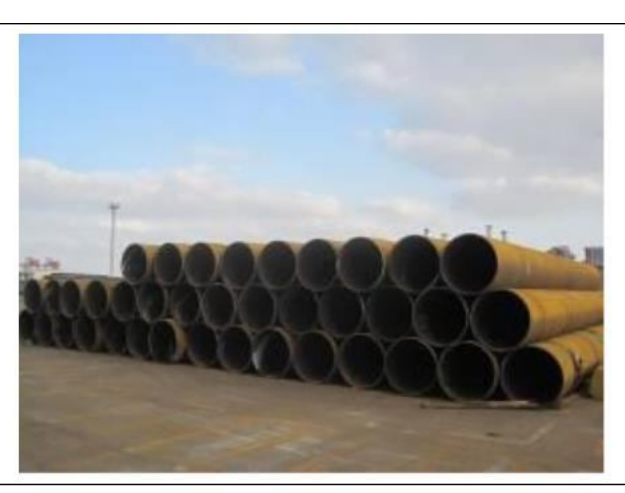
Storage cargo condition on open yard Size:900x20x10000mm