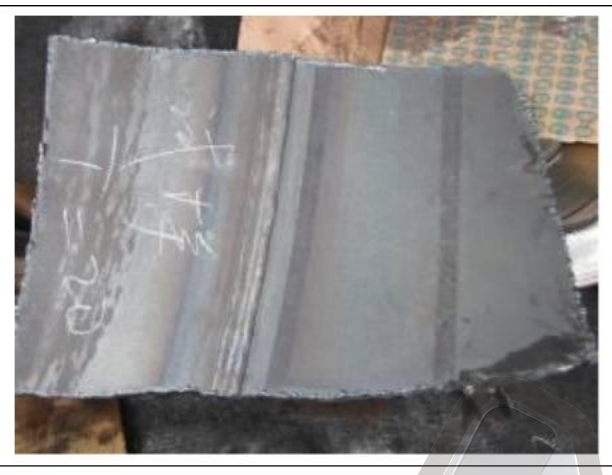
The sample of welding bead