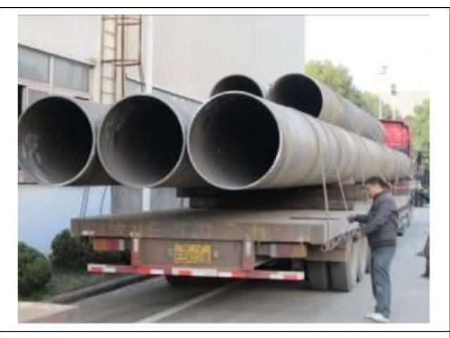
Loading onto the truck at the factory