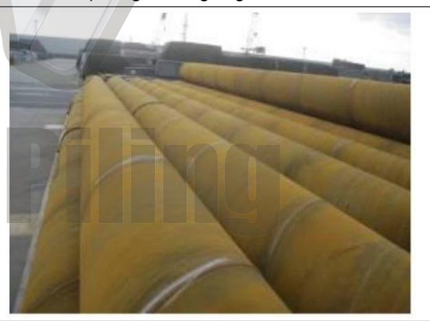
Rust stained on surface