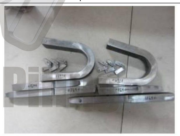
The bending test specimens of raw material