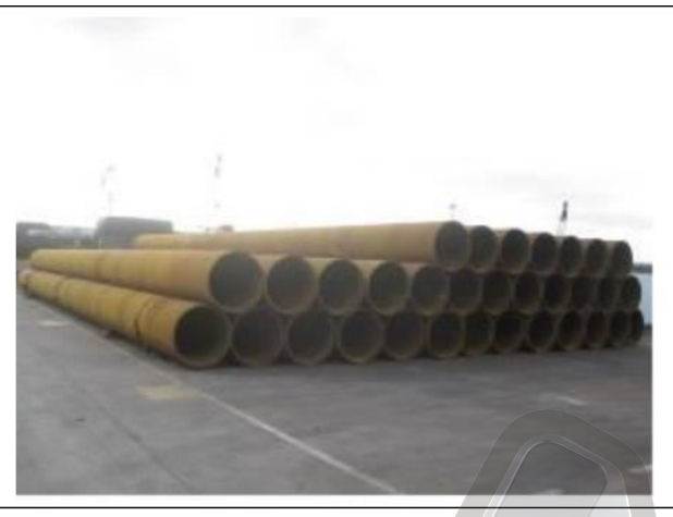
Storage cargo condition on open yard Size:900 x20x19000mm