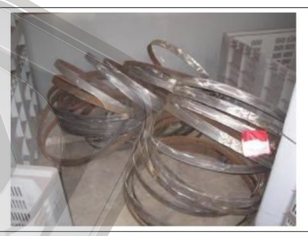
Splicing backing rings: 860x6mm